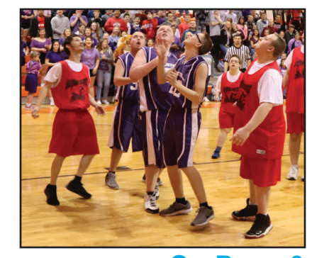
On Page 3 Photos from the Rivals Game vs. the Open Door Jets at Ironton